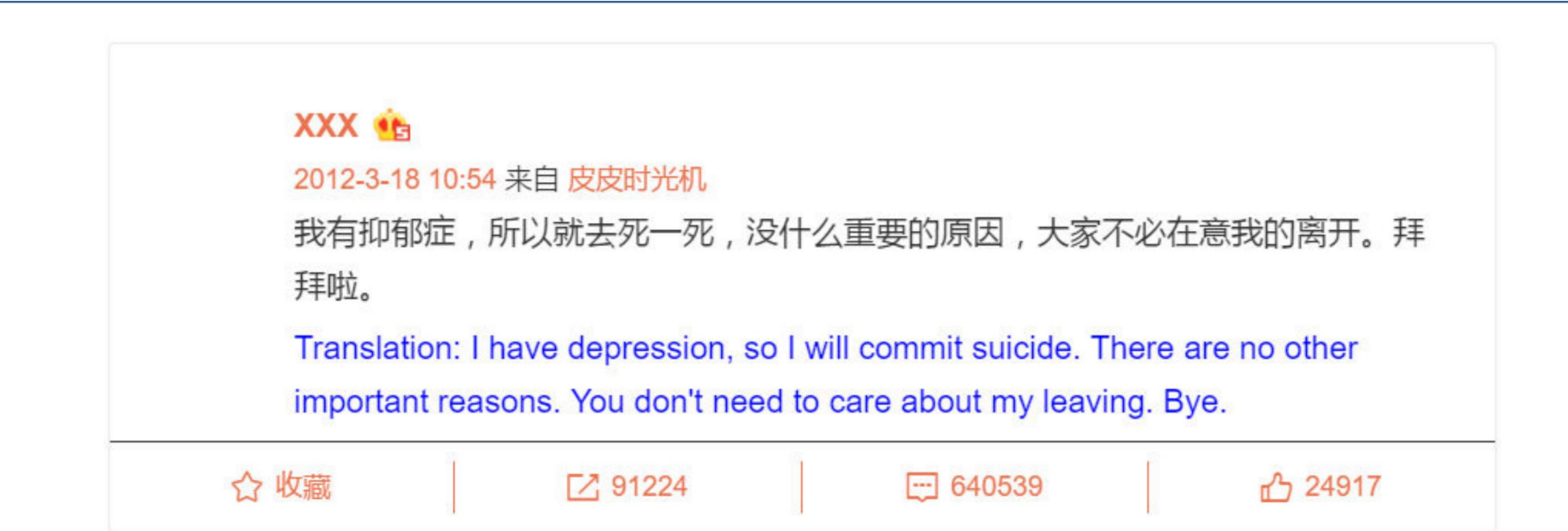
Figure 1. A widely-publicized example of suicidal microblog